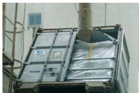
Filling and discharging through 'gravity' possible...