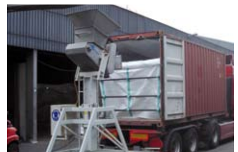
...or through the use of special filling and discharging equipment.