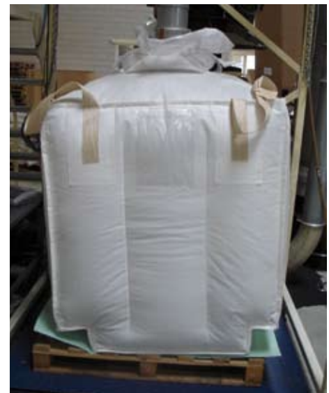
EXIM's newest development: the palletless Q-bag with openings for the forks of a forklift truck.