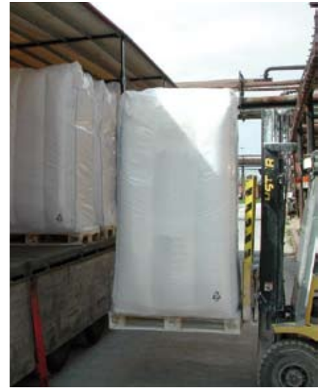
Q-bags can be stacked - 5 high!- with or without pallet.